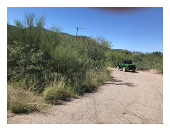
- Submitted by Joe Findysz

The campground had plenty of nice picnic tables and beautiful mesquite trees, providing much-needed shade! We had a great lunch with more food than we could eat! As they say, if there is food involved, you will always have а turnout. But most of all, a good time was had by all!